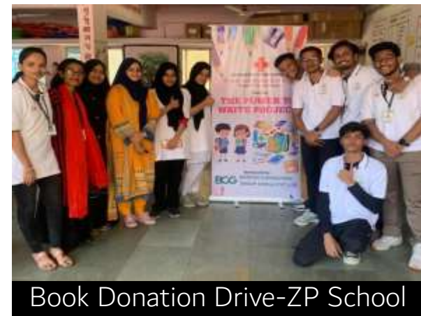
Book Donation Drive-ZP School