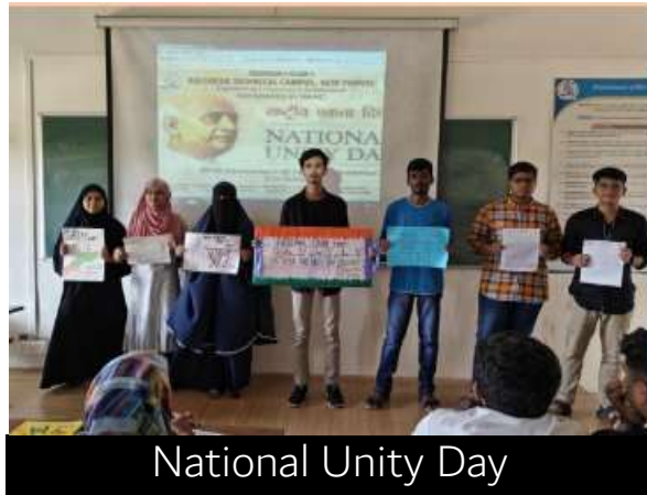
National Unity Day