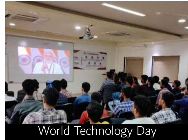
World Technology Day