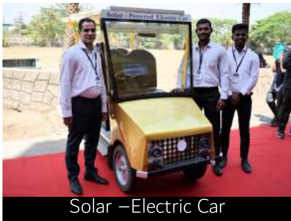
Solar -Electric Car