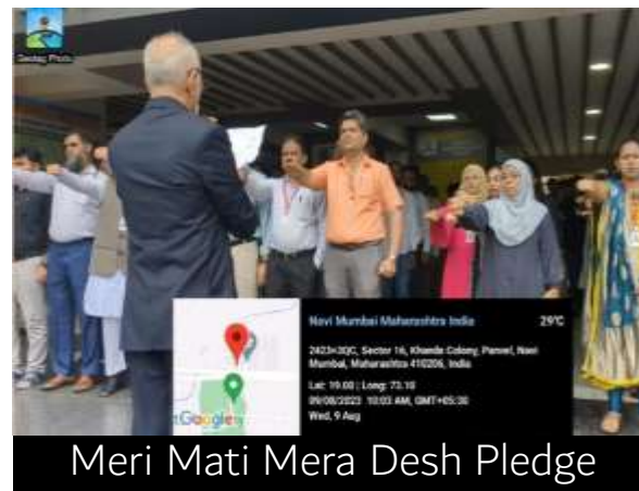
Meri Mati Mera Desh Pledge