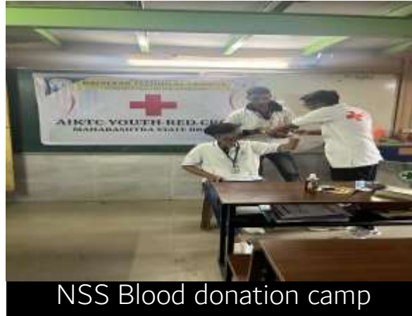
NSS Blood donation camp